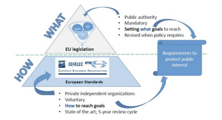
Figure 1: Planned coordination between European legislation and AI standard-making initiatives.

The result of this work will be a set of standards that, if followed, will help ensure compliance with the AI Act . A table from the European Commission's Joint Research Centre (Table 1) illustrates how certain international and European standards relate to key requirements for high-risk AI systems under the AI Act .<sup>44</sup> As with all harmonized standards, the EU has indicated that adherence will not be mandatory. That is, regulated entities may take alternative routes to illustrate they have met the AI Act 's essential requirements, for example, by independently complying with its requirements using conformity assessment.<sup>45</sup> A figure from CEN and CENELEC (Figure 1) outlines the planned coordination between European legislation and standard-making initiatives for AI.<sup>46</sup>